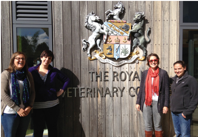
Royal Veterinary College student chapter founding committee.