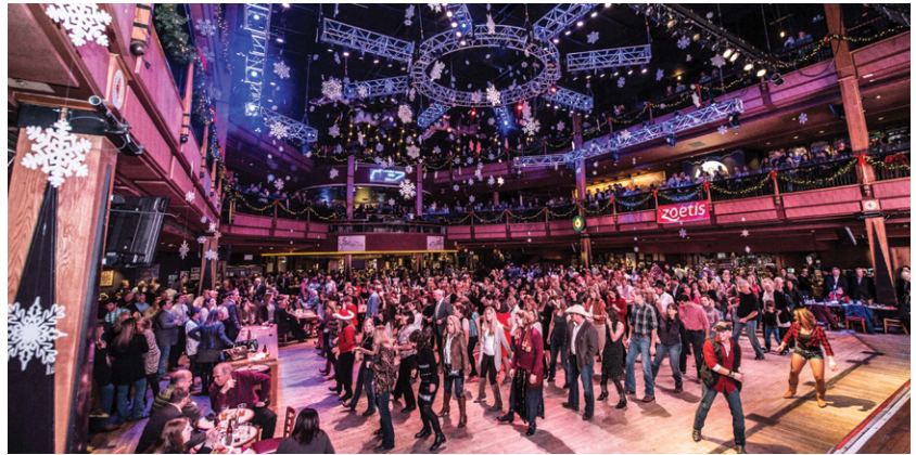
Fun and philanthropy merged at a sold-out AAEP Foundation Celebration at the Wildhorse Saloon.