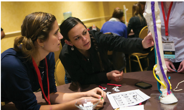
Students explore the anatomy of the distal limb during one of five dry labs added to student programming at the AAEP's 59 th Annual Convention.

Investment in the future of the equine veterinary profession has been a staple of Foundation funding through the years. In addition to the traditional slate of scholarships and short courses, the Foundation in 2013 contributed resources to the inaugural Focus on Students summer meeting and the significant expansion of student programming at the Annual Convention, giving participating students a leg up on their career ambitions.