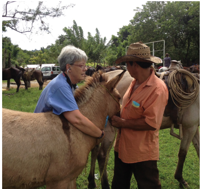
A buckskin mule weanling in Veracruz, Mexico, is examined during the October 2013 Equitarian Workshop.